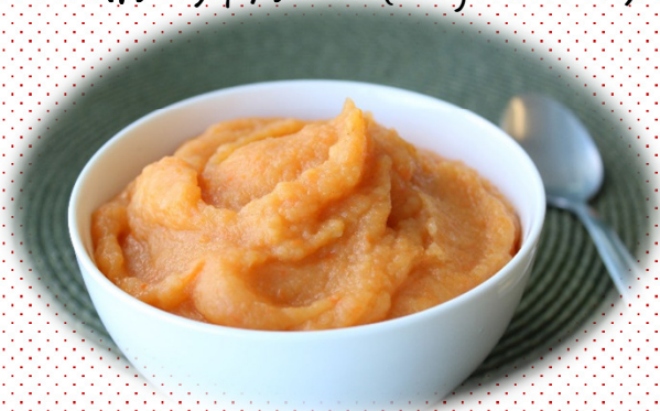
2551 Turnip & Carrot Mashed Sysco 94484, GFS 1061204, Summit 165166