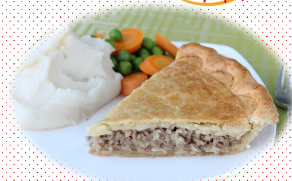
2391 Meat Pie Sysco 4832703, GFS 1061264, Summit 127702