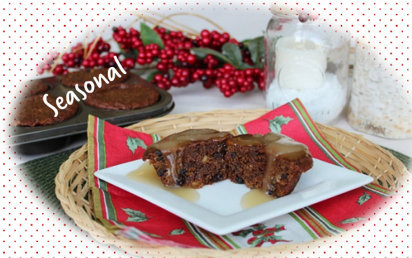
0938 Plum Pudding With Sauce Sysco 5482817, GFS 1061952, Summit 125768