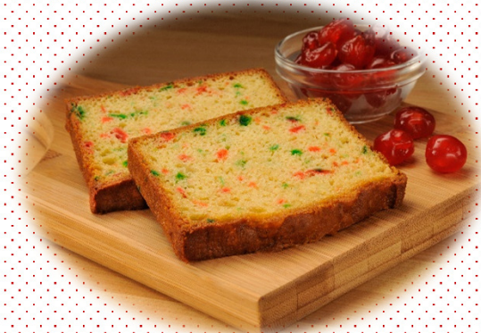
2801 Cherry loaf sliced Sysco 206875, GFS 1184875, Summit 206875

For more information, contact your sales representative.