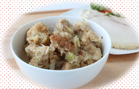
2386 Turkey Dressing Sysco 15141, GFS 1255438, Summit 127722