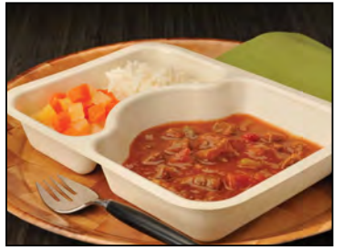
Spicy Beef Stew, Individual 99219 Packed 8 x 280 g Portions 8 x 280 g