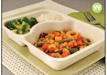
Vegetable Stew, Individual 99597 Package 8 x 265 g Portions 8 x 265 g