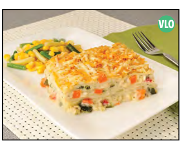
Vegetable Lasagna 2398 Packed 2 x 2.3 kg Portions 24 x 190 g