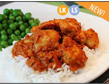
Butter Chicken 2267 Packed 2 x 2.5 kg Portions 50 x 100 g