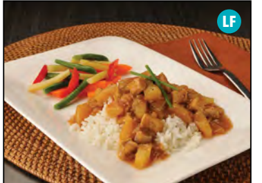
Sweet & Sour Pork 2346 Packed 2 x 2.5 kg Portions 33 x 150 g