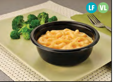
Macaroni & Cheese 0255 Packed 2 x 2.5 kg Portions 33 x 150 g Macaroni & Cheese, Individual 99255 Packed 12 x 200 g Portions 12 x 200 g