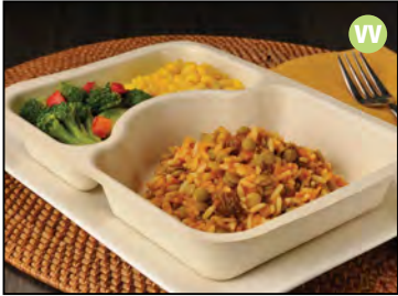
Curried Lentil Cass. Individual 99596 Packed 8 x 260 kg Portions 8 x 260 g