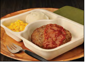
BBQ Beef Patty, Individual 99220 Packed 8 x 245 g Portions 8 x 245 g