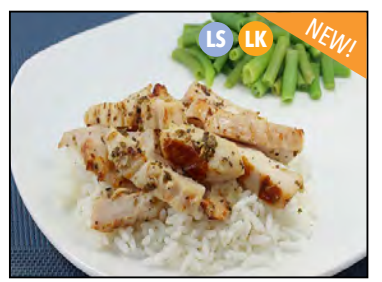
Chicken Souvlaki 2272 Packed 2 x 1.4 kg Portions 35 x 80 g