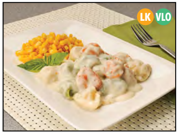
Cheese Tortellini & Basil Sauce 2588 Packed 3 x 2.0 kg Portions 30 x 200 g