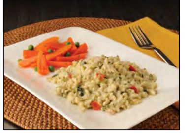
Turkey Casserole Florentine 2287 Packed 3 x 1.82 kg Portions 36 x 152 g