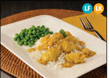
Sweet Curry Chicken 0289 Packed 2 x 2.4 kg Portions 68 x 70 g