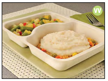
Vegetarian Shepherd's Pie, Ind. 99593 Package 8 x 315 g Portions 8 x 315 g