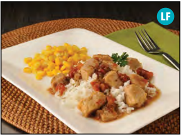
Cooked Jamaican Pork, Mild 2330 Packed 2 x 2.5 kg Portions 50 x 100 g