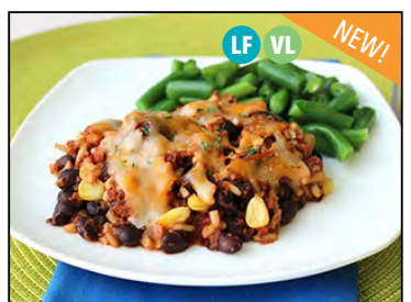
Mexican Rice & Bean Casserole 2595 Packed 2 x 2.5 kg Portions 24 x 200 g