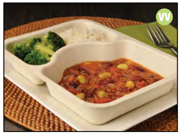
Vegetable Chili, Individual 99381 Package 8 x 265 g Portions 8 x 265 g